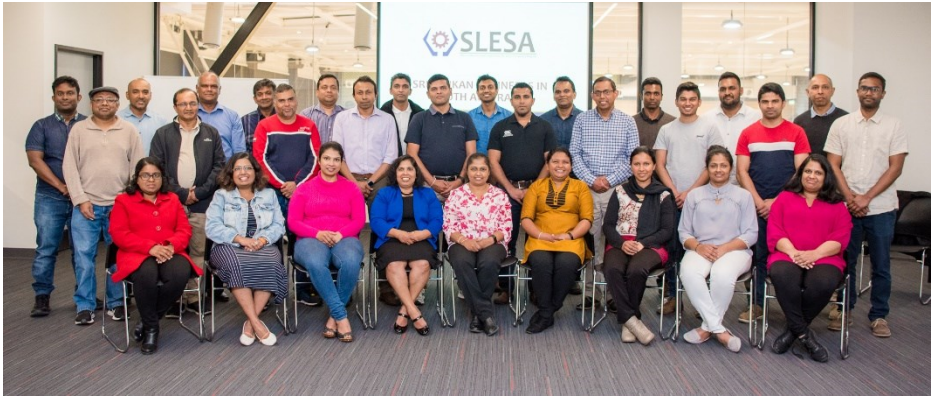
SLESA Members at the AGM 2020

SGM 2021 was a milestone event in SLESA history. 85% of the SLESA members voted for the constitutional changes put forward by the SLESA council.